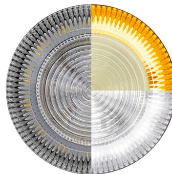
white work light