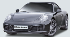
2014 – Porsche Carrera (991)

Front Pads: 355013801 / 355019731 Rear Pads: 355014051 / 355021351