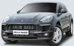
2014 – Porsche Macan (974)

Front Pads: 355013801 / 355019731 Rear Pads: 355014051 / 355021351