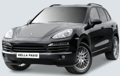
2012 – Porsche Cayenne (958)

Front Pads: 355015801 / 355015131 Rear Pads: 355015101 / 355015121