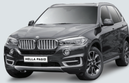
2014 – BMW X5 M

Front Pads: 355015801 / 355015131 Rear Pads: 355015101 / 355015121