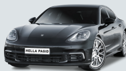
2016 – Porsche Panamera (971)

Front Pads: 355015801 / 355021191 Rear Pads: 355016061 / 355025311