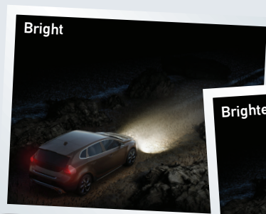
Standard halogen lamps