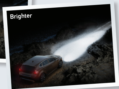
HELLA LED Retrofit